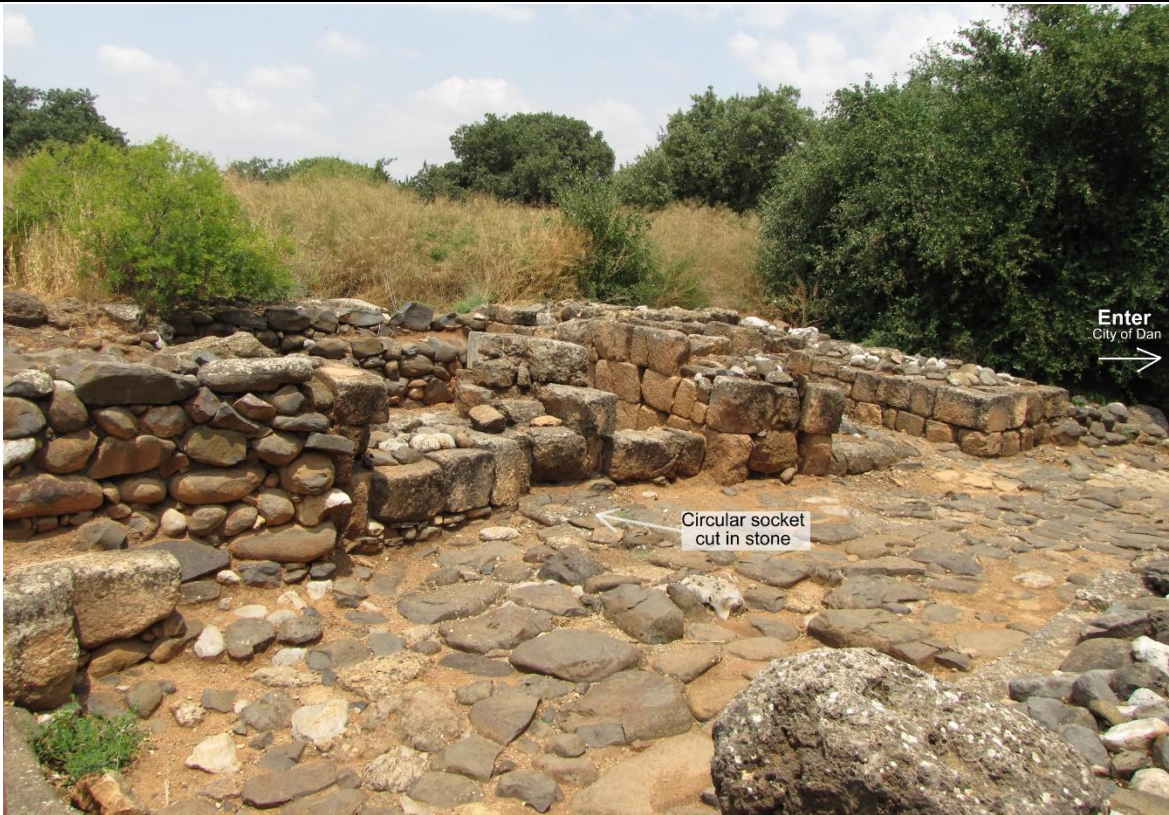
The final and most inner gate of the city with the final series of chambers. Note a socket cut out of stone where one of the sides of the gate doors would have pivoted