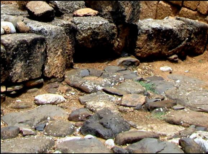
Inner gate swinging door socket for hinge to pivot (at Dan)