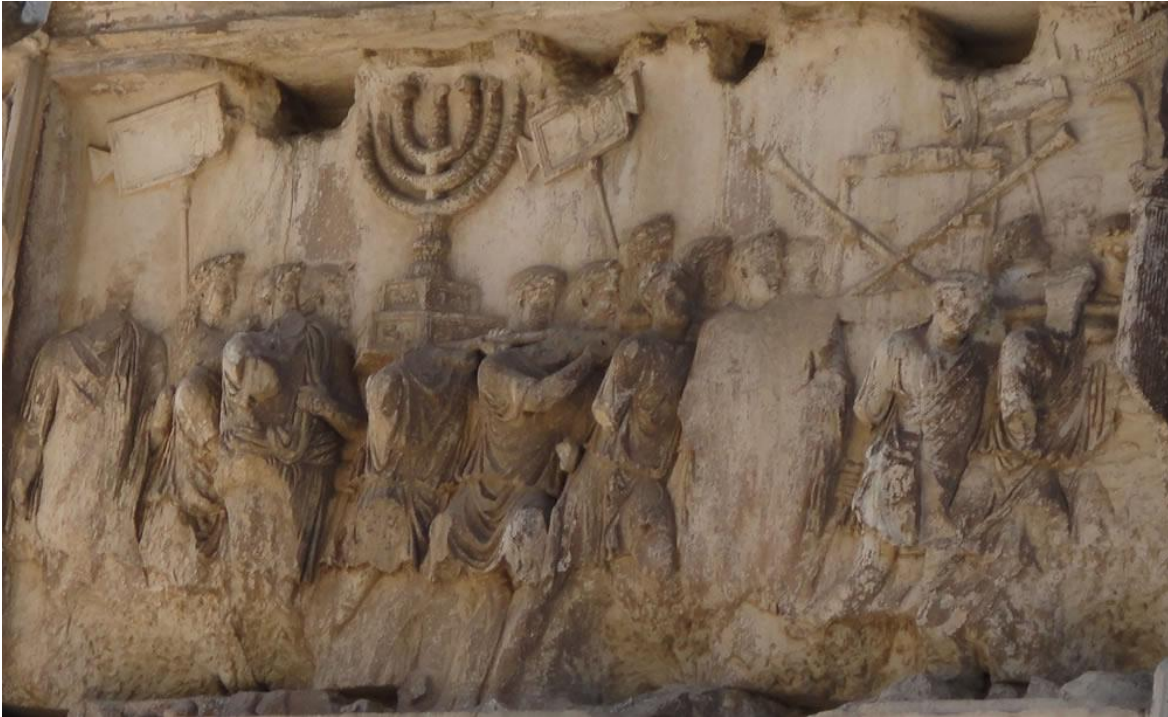
A close up of the triumphal procession. Notice the Candle Stand and the two trumpets which form an “X” over the Table of Showbread as the Romans carry them into Rome.