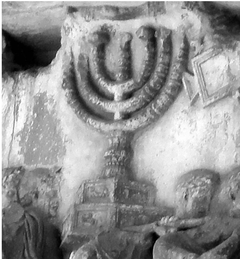
The Golden Lamp Stand from Herod's Temple of 70 AD.