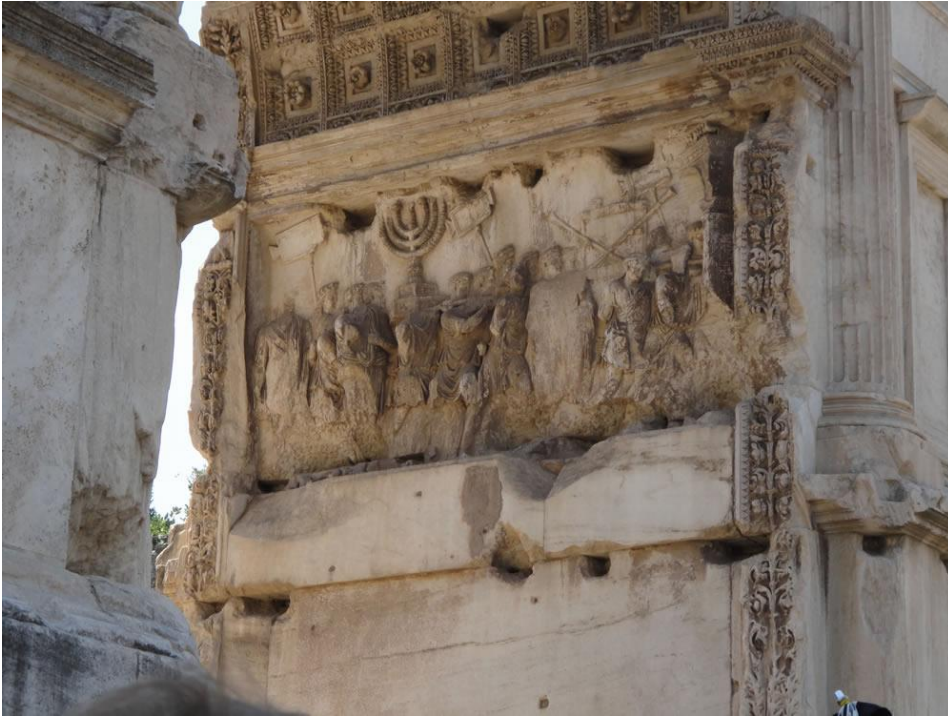
Images from the inside of the Arch of Titus showing the Roman triumphal procession into Rome with the Temple Treasures.

Titus' full name is Titus Vespasianus Augustus. This monument was credited to the Senate and People of Rome and was constructed shortly after Titus' death at the hand of his brother Emperor Domitian.